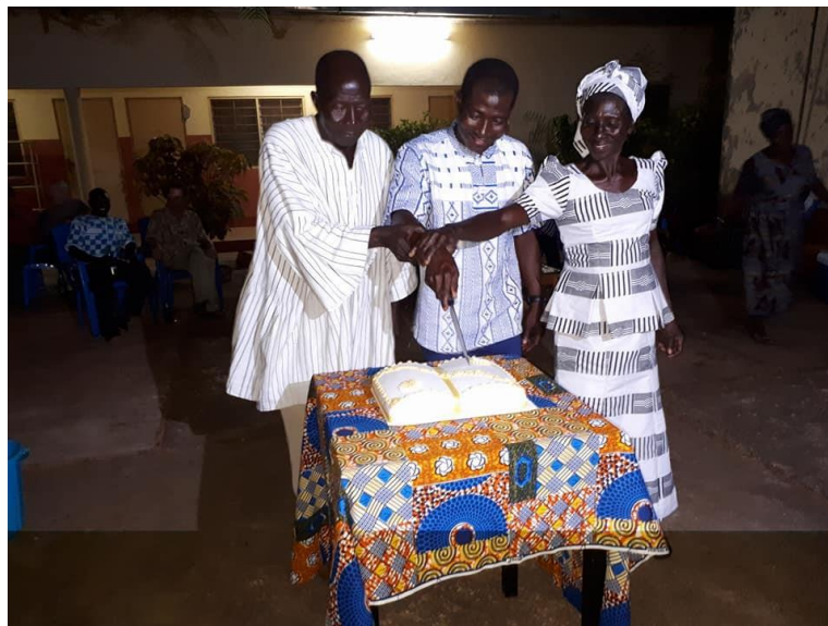
Brother's parents join in the cutting a ceremonial cake for the guests at the profession feast.