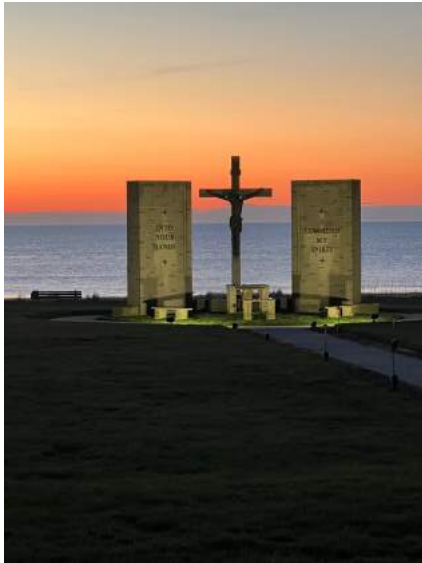
Easter morning sunrise San Alfonso Retreat House, Long Branch, New Jersey

Listen to the Spirit deep within you, as he tries to gentle your disposition, quiet your impulses, soften your speech, make you like Jesus.