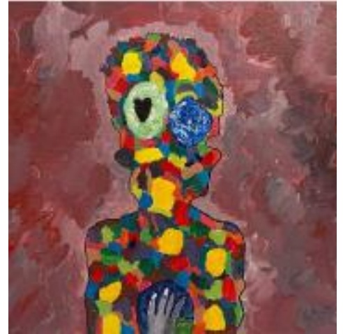
Interceptions Acrylic by Jorge Pogue

https://ercbna.org/Christian Brot hers.php?op=2023Student Art