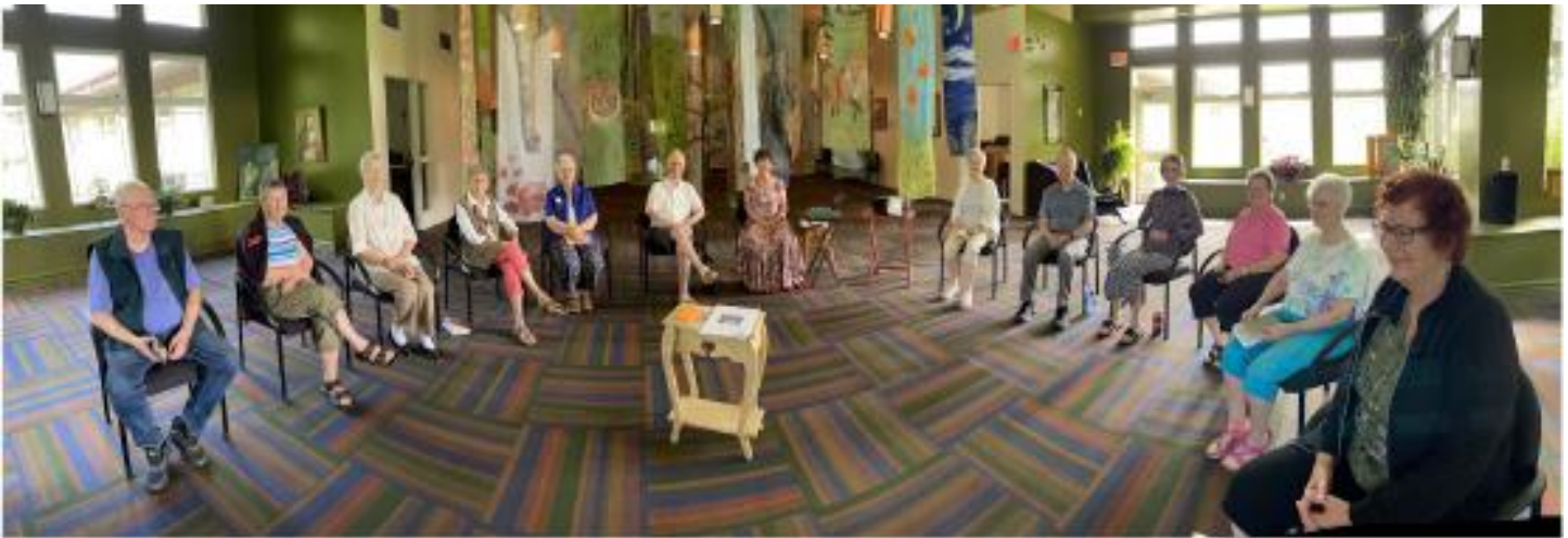
Participants in the 12 th Annual Ecology Retreat. Note the background tapestries.