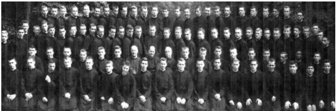
Habit Day 1961

Belonging in a group ever emerging and ever in transition.