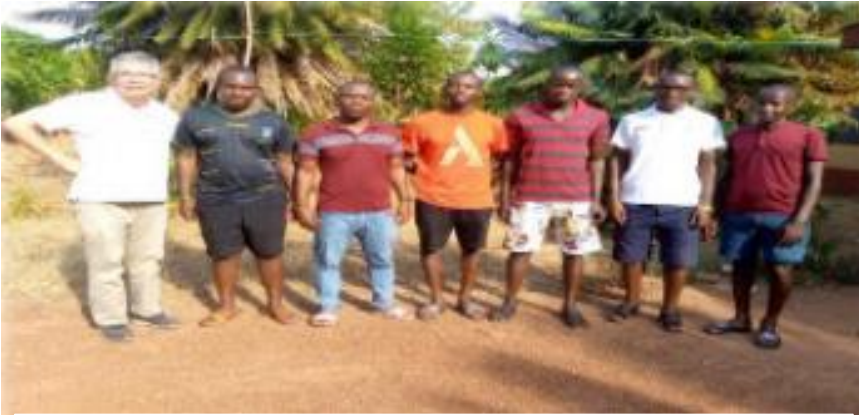
2023 Second Year Novices