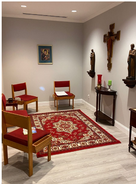
The new Chapel at All Hallows