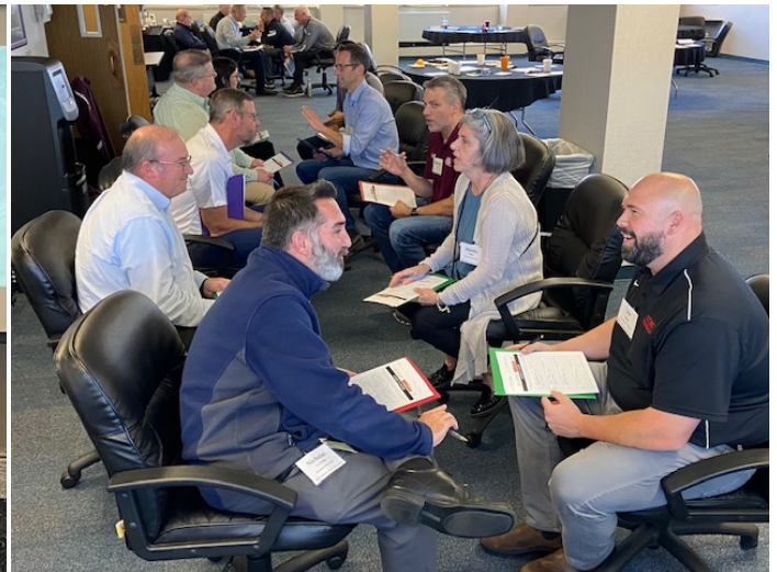
Participants at the School Leaders Retreat