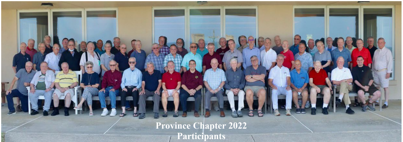
Province Chapter 2022 Participants