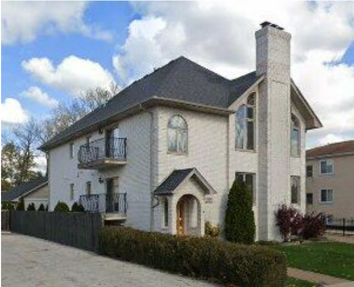
Christian Brothers – 87 th Street Community