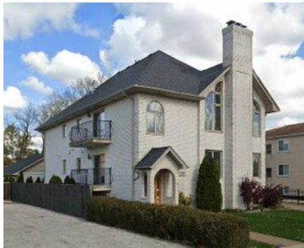
Christian Brothers – 87 th Street Community