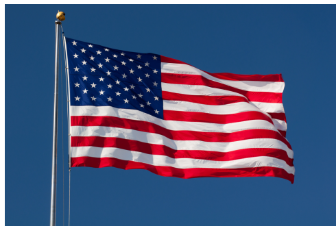
The United States