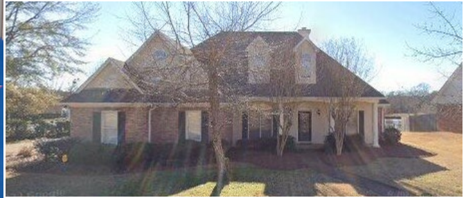
The Community House in Madison, MS