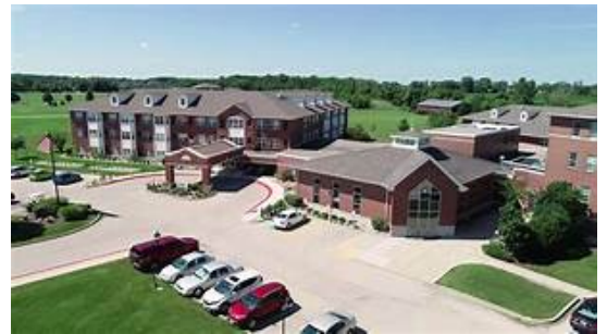
Marian Village, Homer Glen, IL