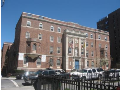
All Hallows H.S., Bronx, NY