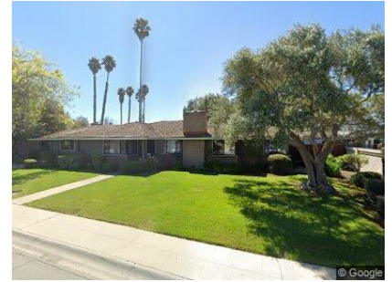
Community House, Salinas, CA