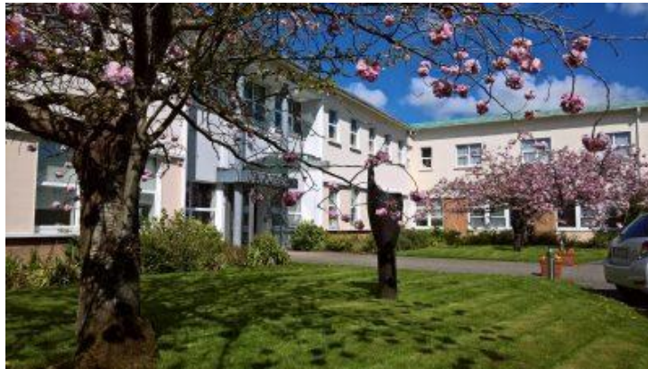
Emmaus Retreat Centre, Dublin, Ireland.