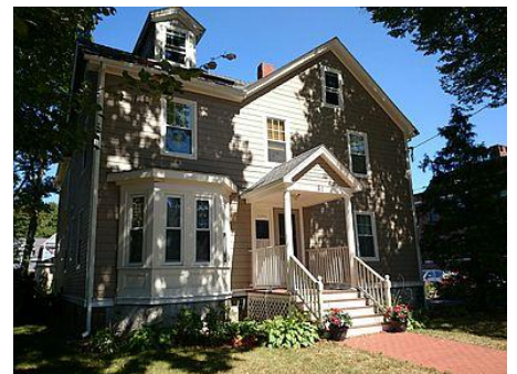
Community House, West Roxbury, MA