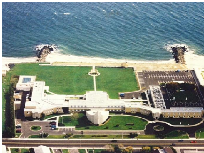
San Alfonso Retreat Center, Long Branch, NJ

The Edmund Rice Christian Brothers North America Province Chapter will take place from July 15, 2022 – July 20, 2022 at the San Alfonso Retreat Center in Long Branch, NJ.