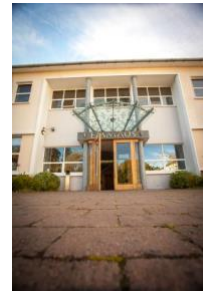
Emmaus Retreat and Conference Center, Dublin, Ireland

The Edmund Rice Christian Brothers North America Province Chapter will take place from July 15, 2022 – July 20, 2022 at the San Alfonso Retreat Center in Long Branch, NJ.