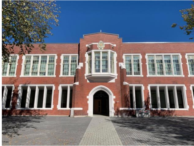
The newly rededicated Lannon Hall