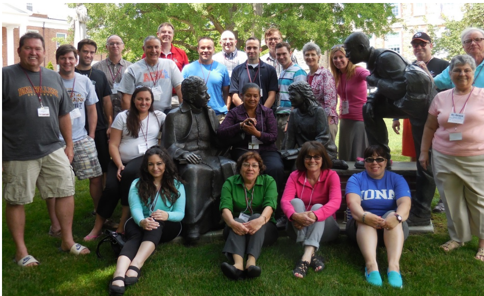
Faculty Faith Formation Workshop participants gather with Blessed Edmund Rice and his students on the Iona College Campus in New Rochelle, NY.

Evaluations of the workshop were very positive. Among the aspects that the participants found most helpful were “engaging in conversations with peers and encouragement to forge ahead.”* Another said, “Seeing the big picture of evangelization and being able to really understand the process of evangelization of new faculty will require great attention.”* A third praised the workshop: “Overall, an eye-opening experience, especially seeing this as a mission toward bringing more faith into the school.”*