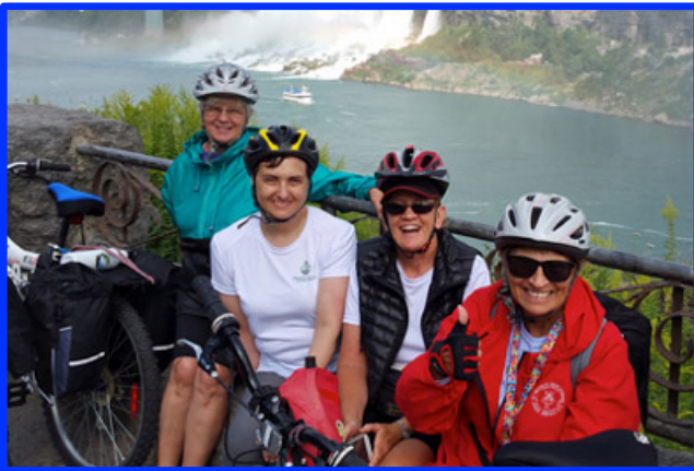
At Niagara Falls with the American Falls in the background.