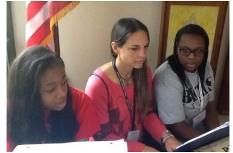
Bishop Kearney students prepare for Liturgy with Trinity Catholic moderator.