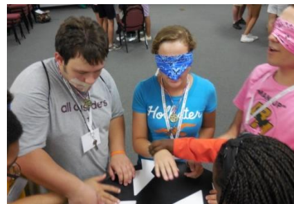
Team work needed!

A favorite activity at ACTION was the Community Build Exercise held on Friday night. Students experienced the struggle to accomplish a series of tasks when members of their group were restricted from seeing, speaking or moving under their own power. How does the group move forward when only a blinded person can build a puzzle or a paralyzed member must negotiate an obstacle course? It takes a community to overcome these obstacles! Creativity abounded as groups worked out solutions to their obstacles. After the exercise, students and moderators spent time reflecting on the experience and sharing their feelings and insights.