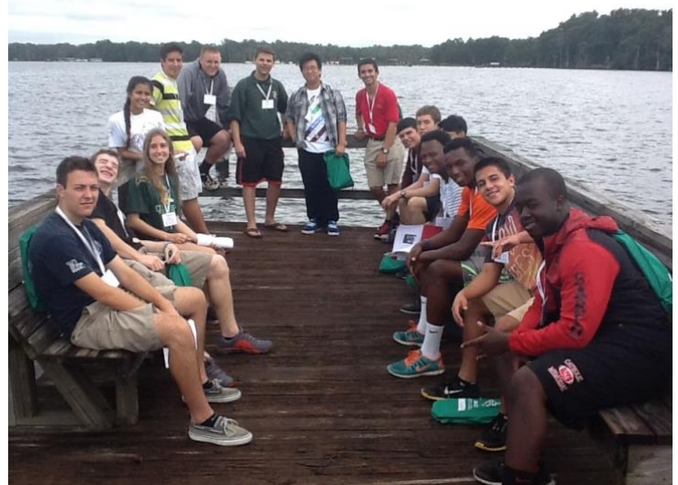
New connections made across the Americas to bring the message of Edmund Rice to all!