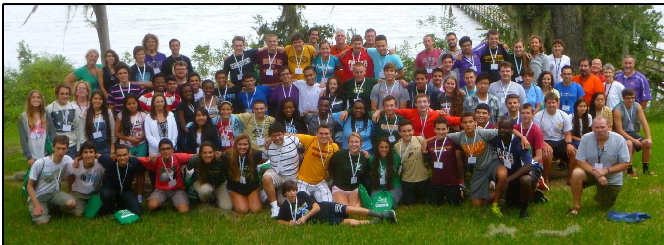
ACTION 2014 Participants

Over the course of the workshop, students and moderators attended sessions that helped them increase their leadership skills and become better communicators and presenters. Students from Bergen Catholic High School sponsored a session entitled, Let the Students Establish Their Church , which invited others to design and implement a Christian Leadership Program in their school.