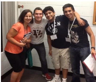
Bergen Catholic HS participants

Over the course of the workshop, students and moderators attended sessions that helped them increase their leadership skills and become better communicators and presenters. Students from Bergen Catholic High School sponsored a session entitled, Let the Students Establish Their Church , which invited others to design and implement a Christian Leadership Program in their school.