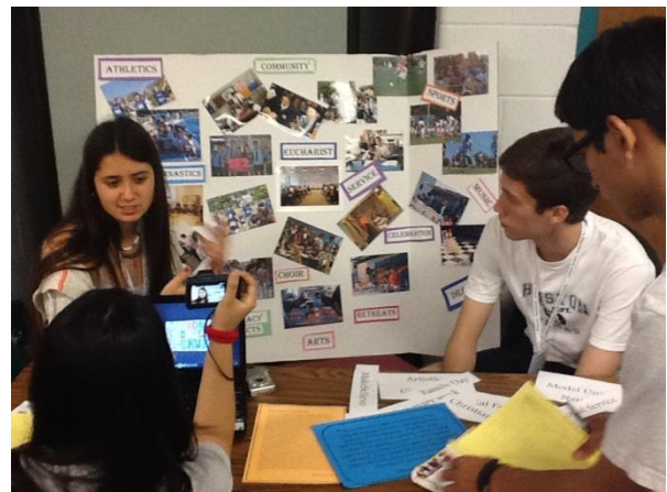
Stella Maris lives their Carta Magna in all school activities.