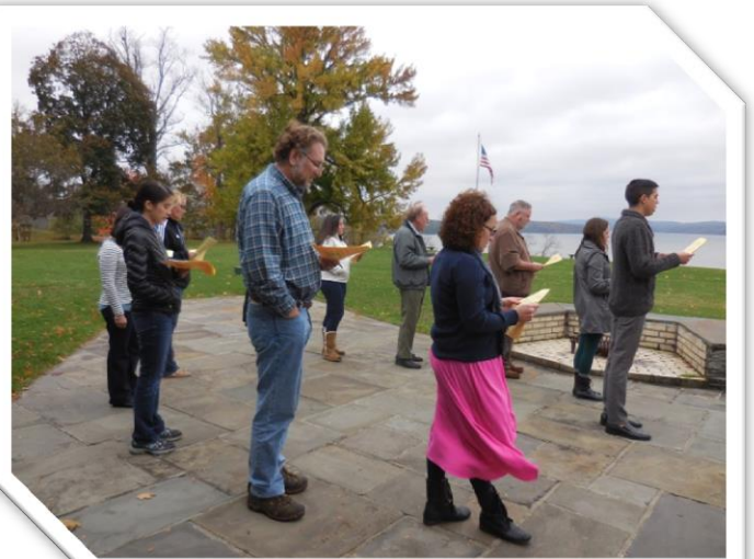
Retreatants pray the "Prayer of the Four Directions" facing west over the Hudson River.

explained how these unique creations will remind them of the blessings of the retreat.