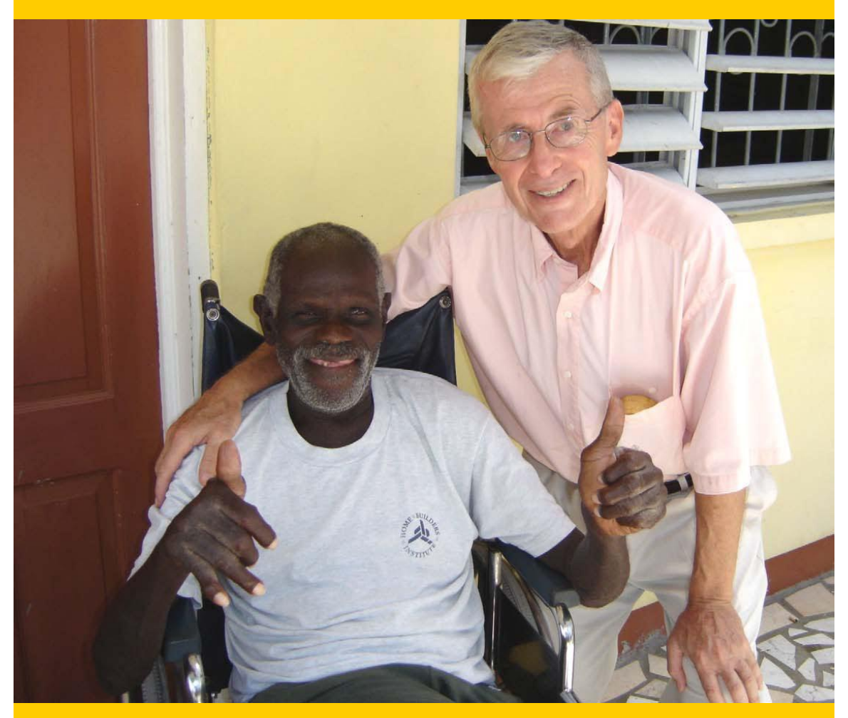
Being a Brother is a rich and fulfilling way to live. www.erbrothers.org

Take time for prayer and discernment and let Him lead you.