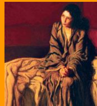
The Annunciation (1898) Henry Ossawa Tanner (1859 – 1937)

"Grant your faithful...the resolve to run forth to meet your Christ with righteous deeds at his coming, so that, gathered at his right hand, they may be worthy to posses the heavenly Kingdom..."