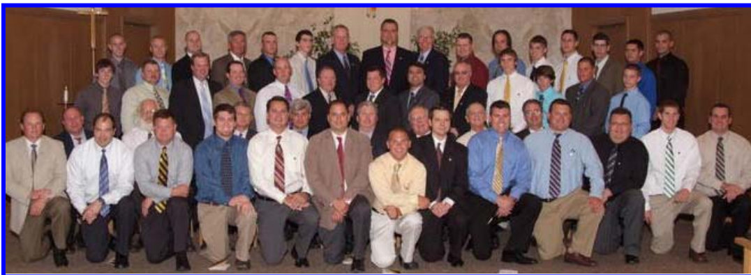
Representatives from each class (1965-2014) gathered in the Chapel