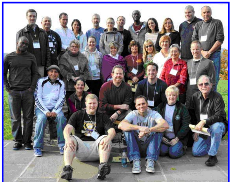
The participants of the Called and Gifted 2010 Workshop

The program was sponsored by the Edmund Rice Christian Brothers North America (ERCBNA) Office of Educational Services.