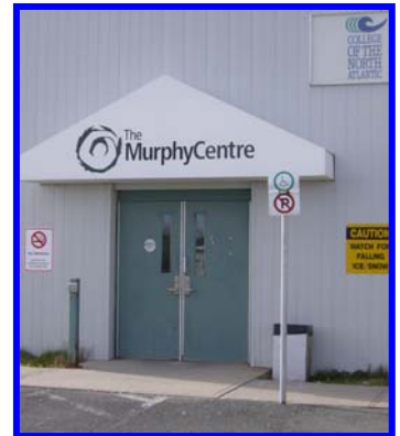
The Murphy Centre on the Campus of the College of the North Atlantic, St. John's.

The Murphy Centre also provides a variety of comprehensive career and employment services ranging from outreach, career and employment counselling, employability skills, paid work placement experience, essential skills and general goal setting services for those participants who are uncertain about their career goals. Well over 400 participants are being accommodated annually within the Murphy Centre career services programming.