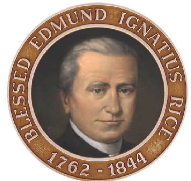
Founder of the Christian Brothers and the Presentation Brothers