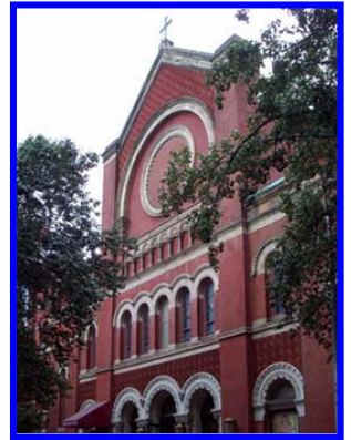
Sacred Heart Church