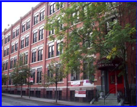
Sacred Heart of Jesus School