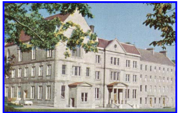
St. Bon's as it was in 1960