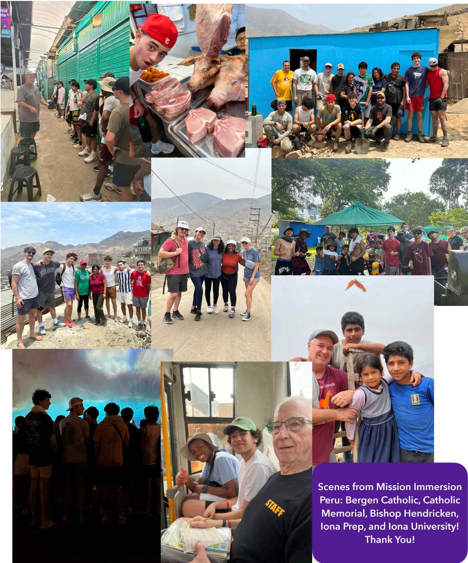
Scenes from Mission Immersion Peru: Bergen Catholic, Catholic Memorial, Bishop Hendricken, Iona Prep, and Iona University! Thank You!