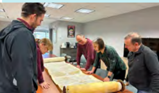
Organizing the library at the Human Rights Institute and examining a Torah from the 1700s that survived the Holocaust. (cont. p4)