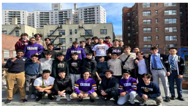
Visiting the All Hallows Rooftop Garden