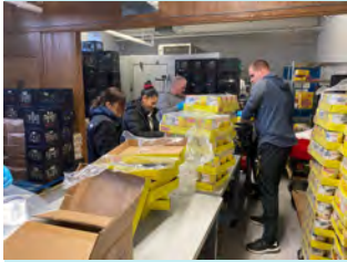
Upper and Lower School Teachers at Hope Services Food Distribution Center, New Rochelle.