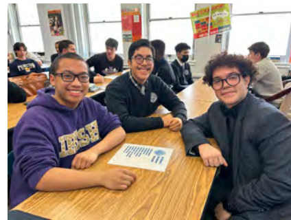
Visiting Vancouver College