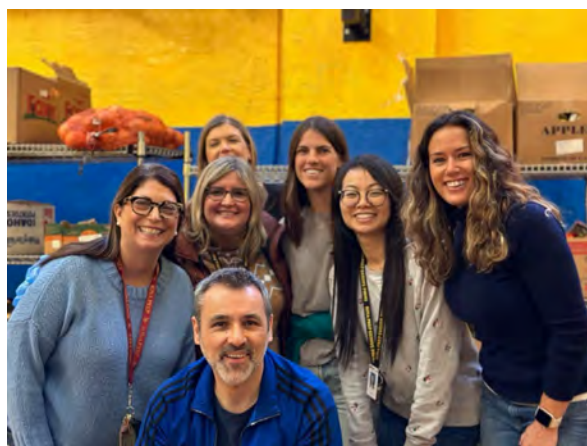
Restocking the food pantry at the Don Bosco Center in Port Chester, NY