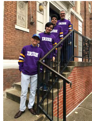
The All Hallows ambassadors back in the Bronx in our VC finery