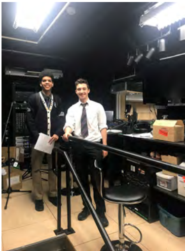
Backstage at the VC Theatre