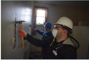
Demo Day at Fuller Centerny Disaster Team HQ at Emmanuel AME Church