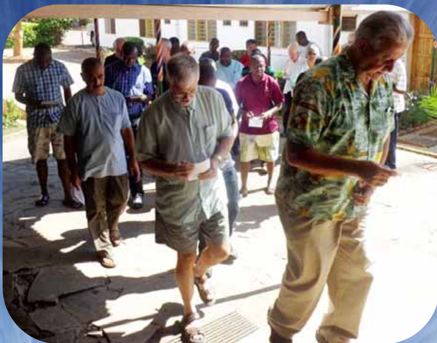
Brothers processing in the meeting hall during the opening ritual