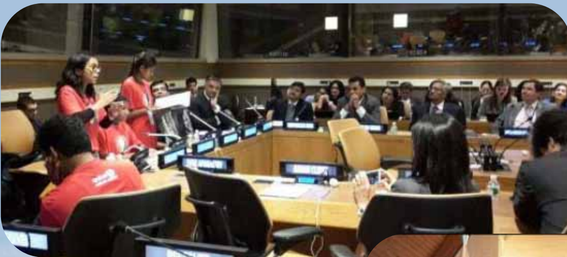
Addressing the UN (above) and visiting Iona Prep in New Rochelle, NY (right).