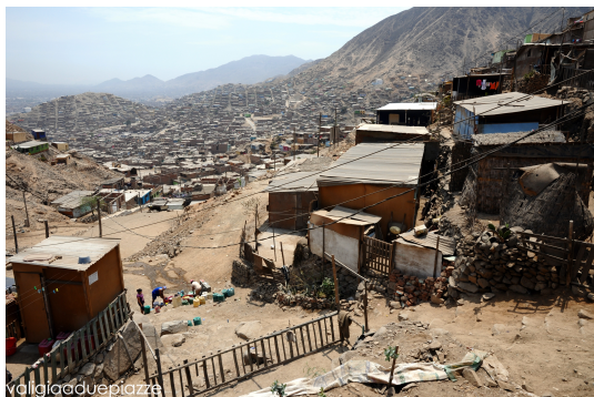
Canto Grande, Lima, Perú

As the COVID-19 pandemic continues to impact our world, the Edmund Rice Christian Brothers North America Province Immersion Program has responded by establishing virtual immersions for our schools throughout the winter and spring of 2021.