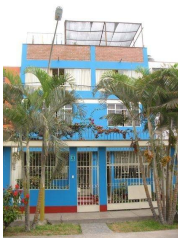
Casa Hendricken, Lima, Perú