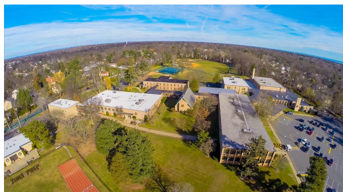
Iona Preparatory School, New Rochelle, NY