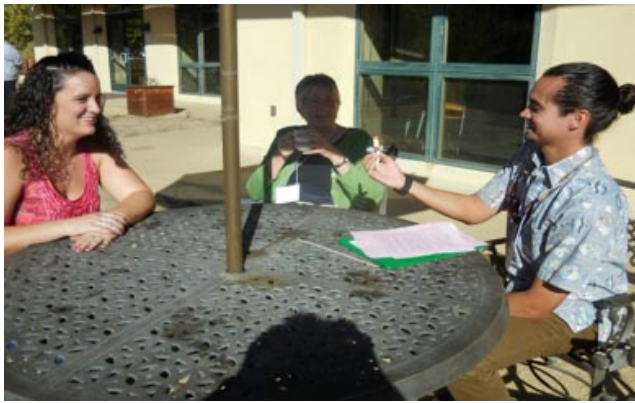
.... a time for sharing...