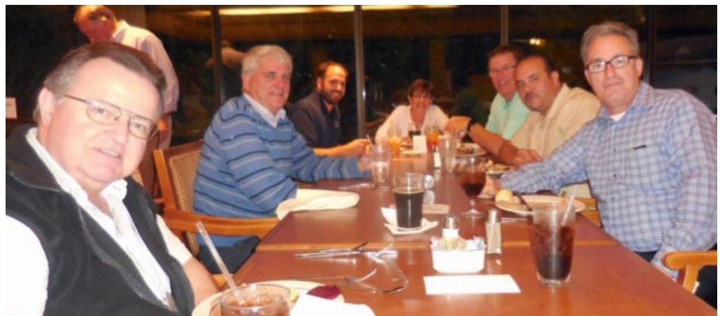
Edmund Rice educators relax after dinner.