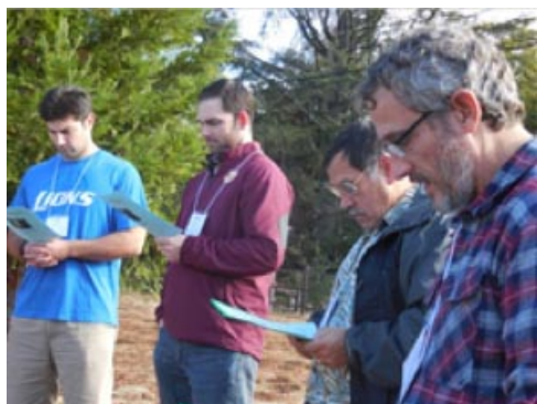
A time for praying (the Prayer of the Four Directions)...

California this year to make it easier for folks in the western schools to attend. It was held at the Presentation Center nestled in the Santa Cruz Mountains. Participants came from St. Thomas