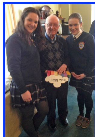
Student representatives presenting a birthday gift.