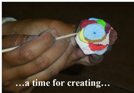
...a time for creating...