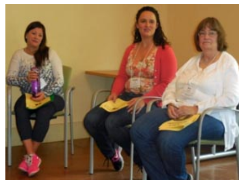
...a time for listening...