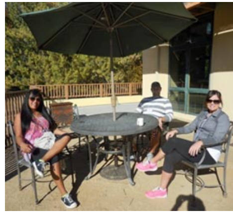
...a time for relaxing...