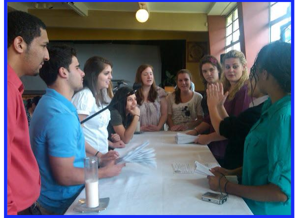
Students from Iona College participate in a variety of activities with students from Archbishop Curley Notre Dame 6 to 12 Prep while visiting Miami as part of their involvement with the Iona In Mission program.

For more information about the role of the Congregation of Christian Brothers at Archbishop Curley Notre Dame 6 to 12 Prep, visit www.acnd.net .