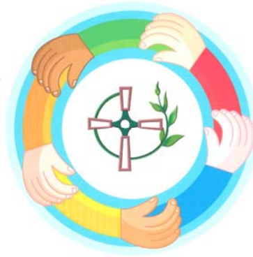
Logo for school leaders meeting