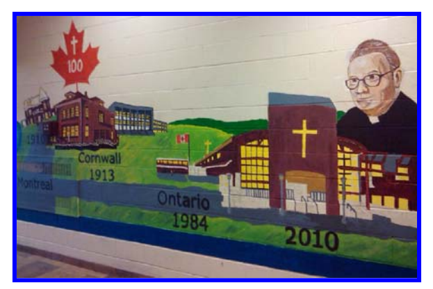
The mural unveiled at the celebrations.