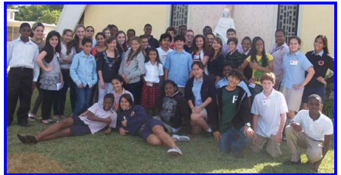
Students from Immaculate Conception (Hialeah), St. Mary's (Miami), Blessed Trinity (Miami Springs), St. Hugh's (Coconut Grove), St. John the Apostle (Hialeah), St. Rose of Lima (Miami Shores), St. Lawrence (North Miami), St. Patrick's (Miami Beach), Our Our Lady of the Lakes (Miami Lakes) and ACND's 6-7-8 Brother Rice Honors Academy join ACND student leaders at their annual Leadership Workshop.

This year the workshop also welcomed the first group of student leaders representing ACND's grades 6-7-8 from Brother Rice Honors Academy.