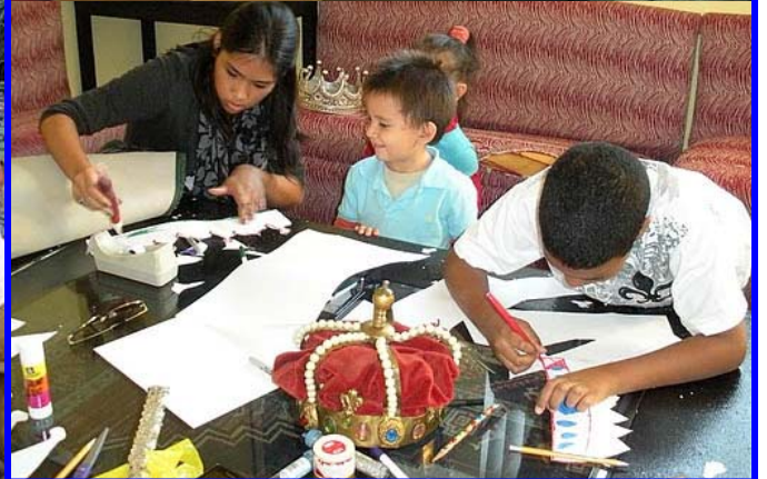
Children ranging in age from four to eleven participated in Archbishop Curley Notre Dame High School's "A Walk to Bethlehem" – an interactive Christmas pageant where student leaders and children prepare costumes and props before staging the Christmas story.