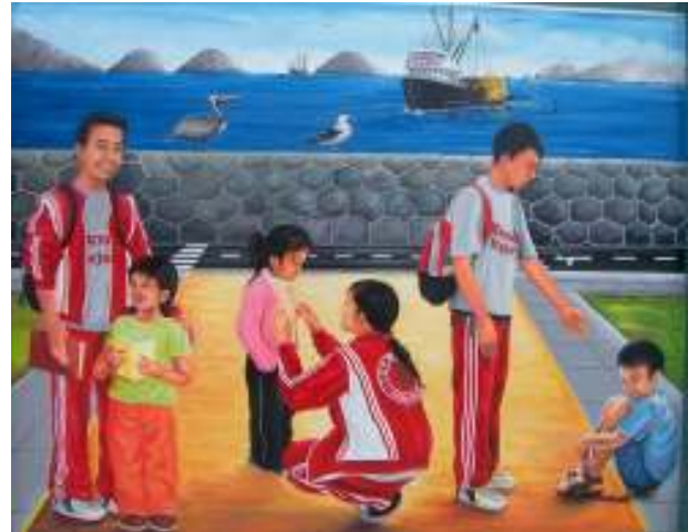
This mural depicts Mundo Mejor students doing their pastoral activity near Chimbote's harbor.

“Two ports in distant seas join hands ...” Chimbote-- Waterford