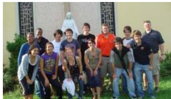
Stella Maris representatives and others at ACTION workshop in Florida.