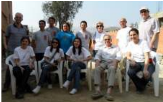
The Uruguayan visitors pose with their Christian Brother hosts on a sunny day in Cochabamba.