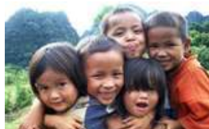
Day of the Child