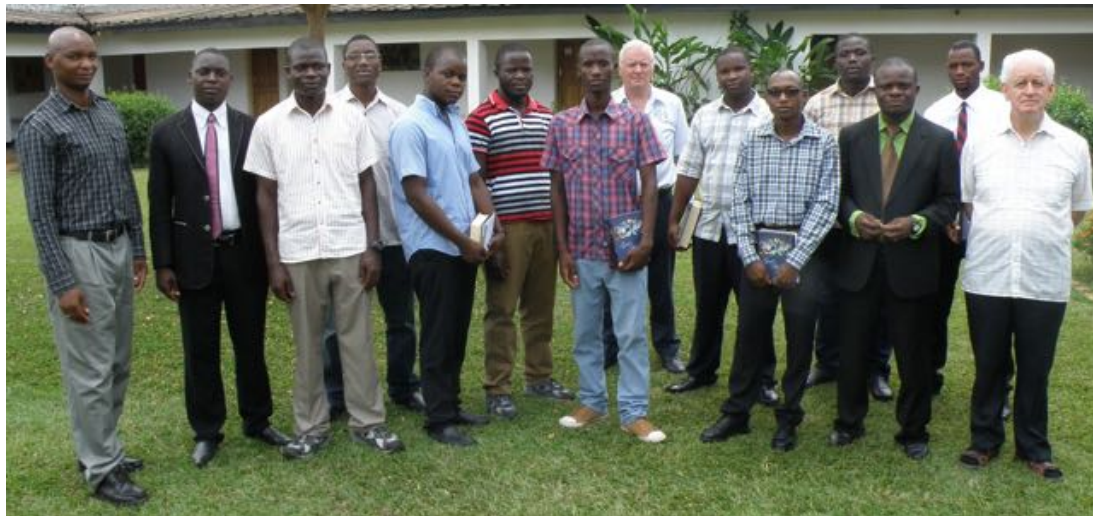
New novices and formation team members in Lusaka

The day was full of joy as we moved one step ahead. A step that we hope will enrich us and help us know ourselves better. Besides, it was a day of blessing and receiving the Word. A day full of sharing and encouragement from brothers and sisters, both from the community and outside. We pray that the good Lord who started this good work in us may accomplish it. We request your prayers.