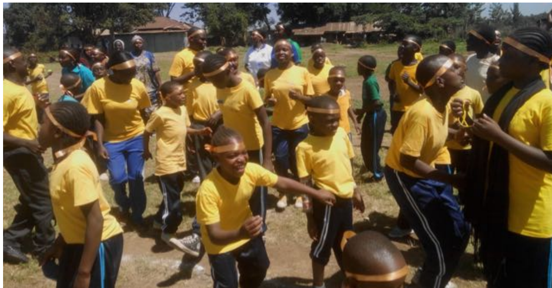
Children of Mary Rice Centre having fun