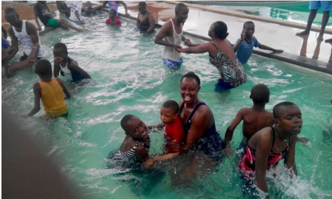
Children and Staff of MRC enjoying swimming

On the 4 th November 2015 the children of Mary Rice Centre had another opportunity to participate in a wonderful picnic. We went to Rock City gardens on the outskirts of Nairobi. The venue gives children an opportunity to try different games.