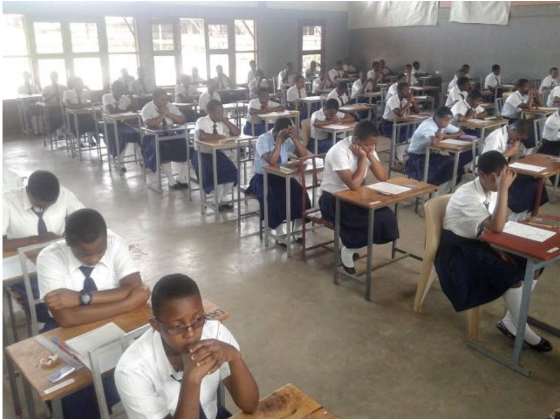
Students of Edmund Rice Sinon Secondary School during their final examination

The form 4 national examinations in Tanzania are currently taking place. At Edmund Rice Sinon Secondary School, all 246 candidates are engaged in this crucial exercise. During free times, if you happened to step in the school compound, you will most likely see the candidates either reading privately or engaged in serious group discussions. To some extent, the exams have brought in discipline and seriousness of the candidates. Since nobody wants to fail, no wastage of time is evident among the candidate at this stage. The exams kicked off on 2 nd November and are expected to conclude on 27 th November 2015.