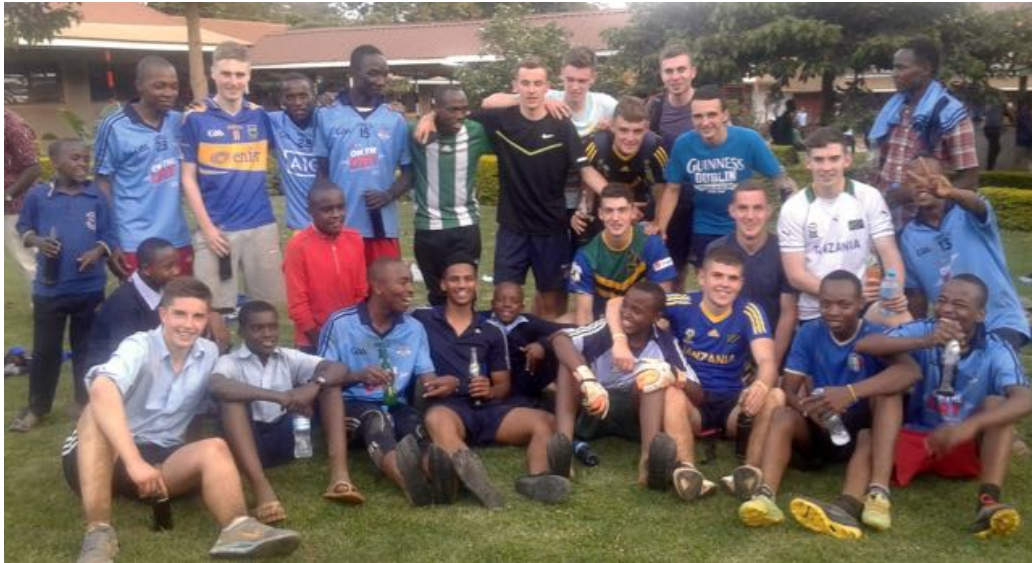
Students of St Aidan's and ERSSS in Arusha

For the past one week, Edmund Rice Sinon Secondary School has been hosting an immersion group from Ireland known as St. Aidan's. The group arrived on 24 th October 2015 and is expected to fly back home on 4 th November 2015.