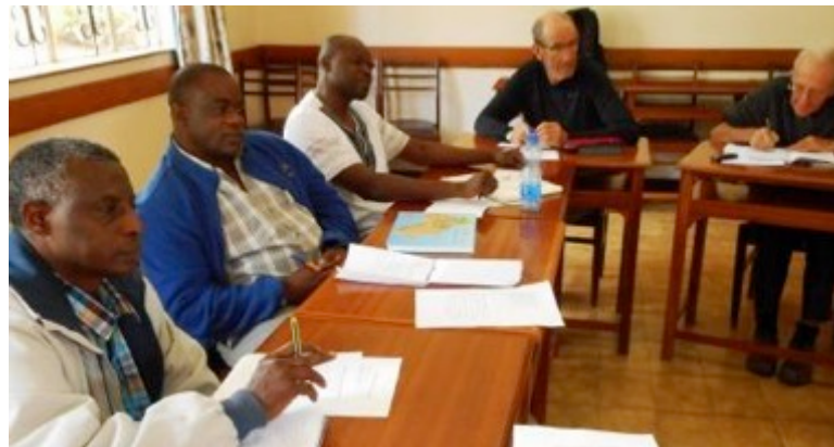
Section of Ministry Leaders during the gathering

Our Way Into the Future is not affecting just the Brothers. It has implications for our ministries as well, and sharing the Edmund Rice vision and values with our co-workers in the ministries is