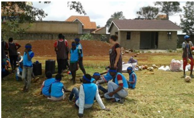
Edmund Rice Camps children and leaders

With 75 children and only 26 leaders we tended to struggle a bit but the leaders were superb, carried on with great energy and craziness and showed they are remembering