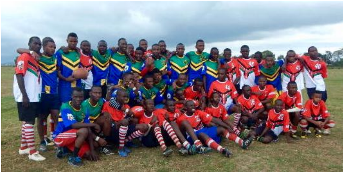
Kenya Buffaloes (BBCEC) and Tanzanian Simbas (ERSSS)

The second Zimele Foundation sponsored exchange was hosted last week by Edmund Rice Sinon Secondary School who welcomed a group of seventy students and staff from Brother Beausang who made the trip to Arusha on Sunday July 5.