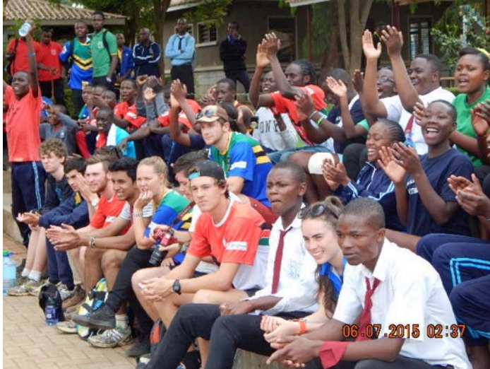
Crowd at the match