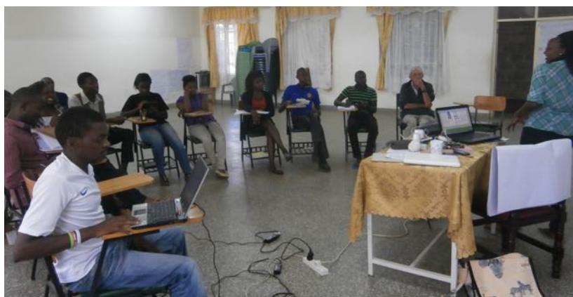
Members of the Edmund Rice Karibu Group

It was an incredible marathon of three full days. I’ve never experienced anything non-stop like it as from 8.00a.m Friday till 8.00 p.m Sunday evening. 12 members of the Edmund Rice camps youth labored over goals, objectives, activities, assumptions with unrelenting good spirit. There wasn’t one break in any of the three days which extended until 10.00 p.m each night.