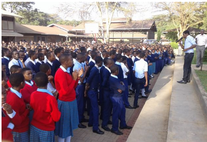
Students of ERSSS and Staff

Again, Edmund Rice Sinon Secondary School has done it! While the school is still celebrating the Form Two National Examination results which were published early this year, the Form Four results have also provided us with unbelievably good news. The coincidence is that the Form Four results were published on