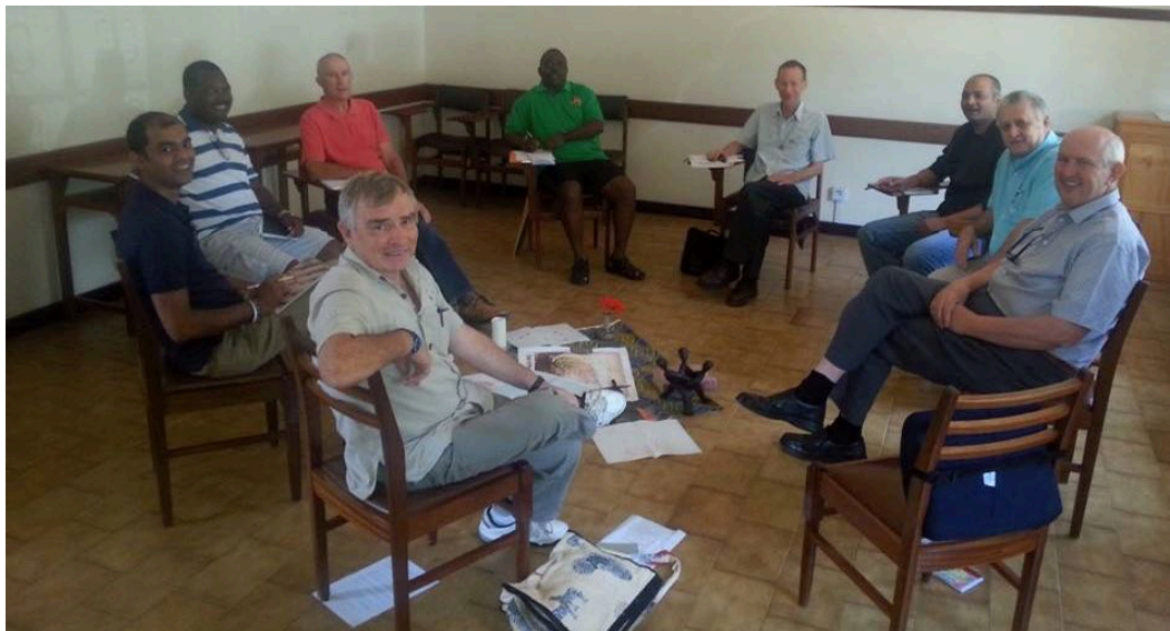
Meeting of PLT and TST members

Here is couple of photos of their time here in East Africa District: