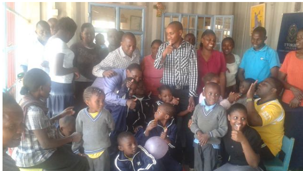
Cleanshelf Supermarket staff, children of MRC, parents and MRC Staff

This is the first local supermarket that has visited the Centre and extended their support to us. The visit brought joy to the children, parents and staff of Mary Rice Centre. They brought food packages and many other things for the children from their supermarket. It was a wonderful gesture.