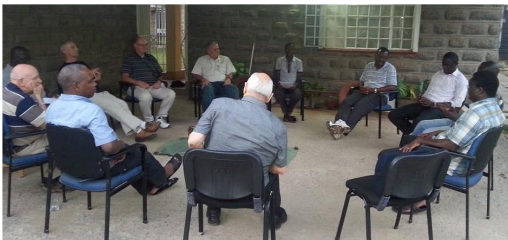
PLT hosted for evening meal and prayer by Karen Community