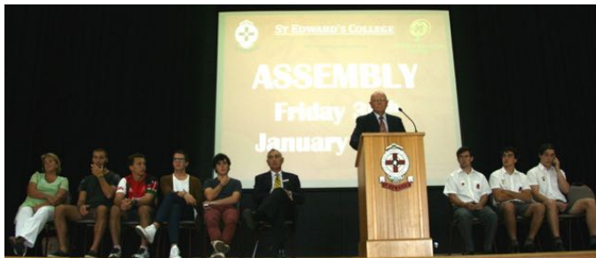
Russell Peters speaking at the Assembly