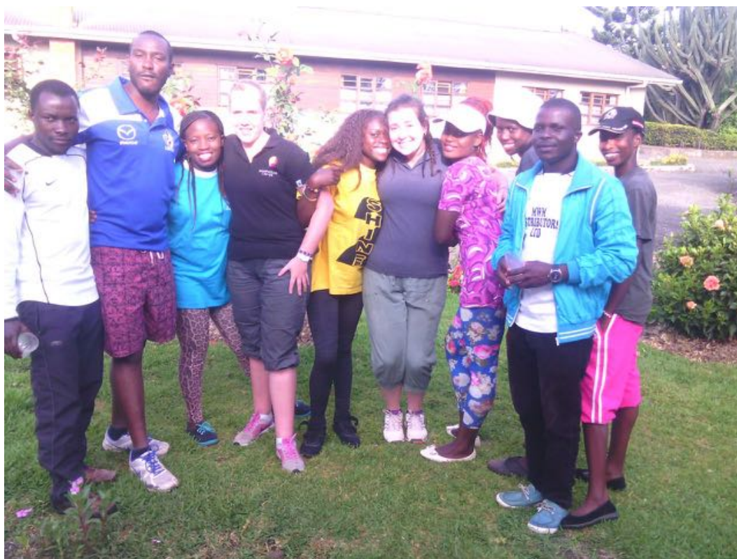
Edmund Rice Camps Leaders

The Edmund Rice Karibu Camp leaders began the year 2015 in the best way. We had an opportunity to go to Tanzania and run a camp for the children there. I remember every detail of each day. It felt different being in a new country. We immersed ourselves among new people, learning their National language (Kiswahili mwafaka / mufti), sharing their joys, eating their meals and drinking their soup. The Tanzanians were so disciplined and humble. It was easy to make friends with them.