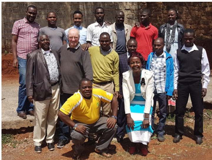
Members of the Edmund Rice Network

On Saturday, June 24th, members of the Edmund Rice Network (ERN), East Africa came together from Arusha, Eldoret and Nairobi to share their experience of being part of ERN. The main content of the day was centered on what each group achieved so far and what plans are in the works for the near future.