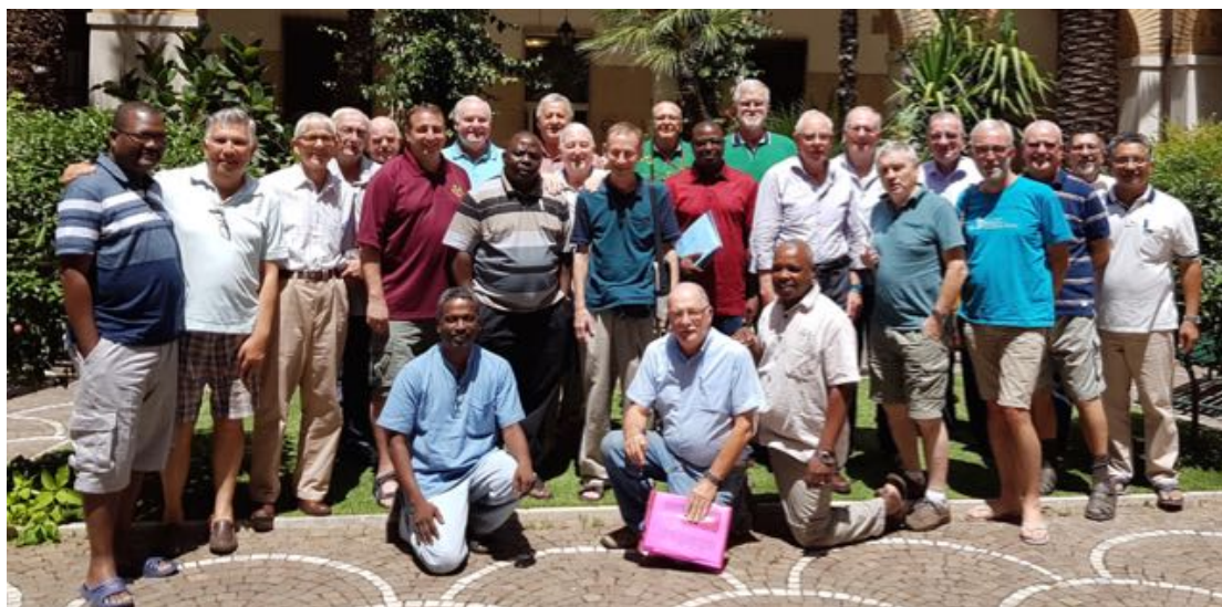
Members attending the CLG meeting

The Congregation Leadership Group (CLG) meeting has entered its second and final week, after a restful weekend where members took opportunities to explore what Rome and Italy has to offer. Africa Province representatives seized the opportunity by travelling out of Rome to bond and relax together.