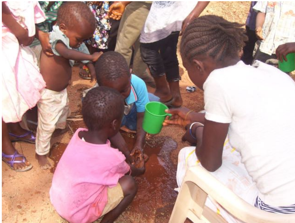
Older kids helping young ones

Solidarity Teachers College came along to lead some games and activities.