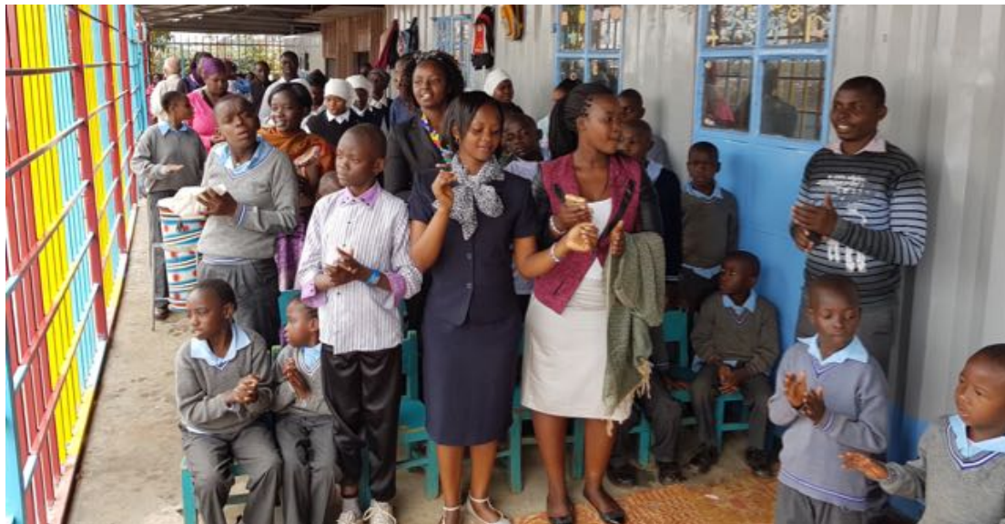
Staff, Children and parents during the Eucharistic celebration